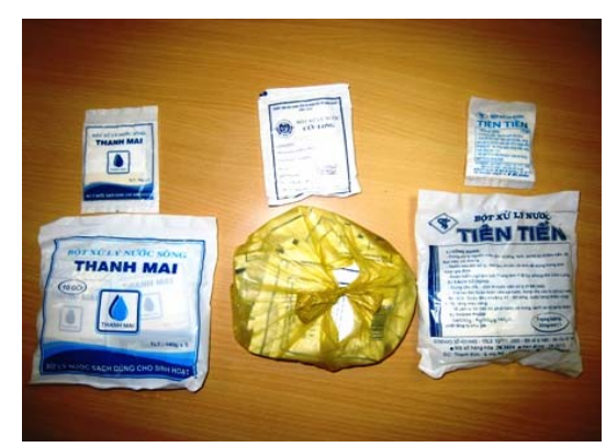
Water Treatment Powders