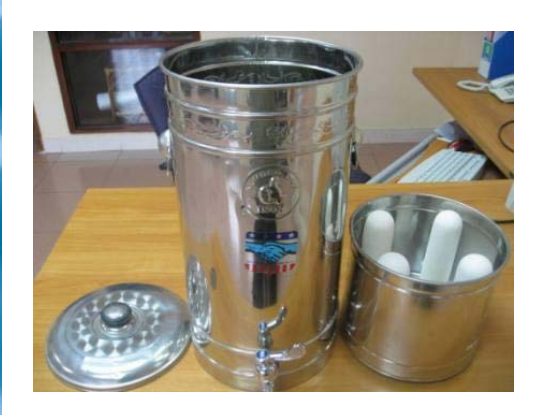
Candles Ceramic Filter