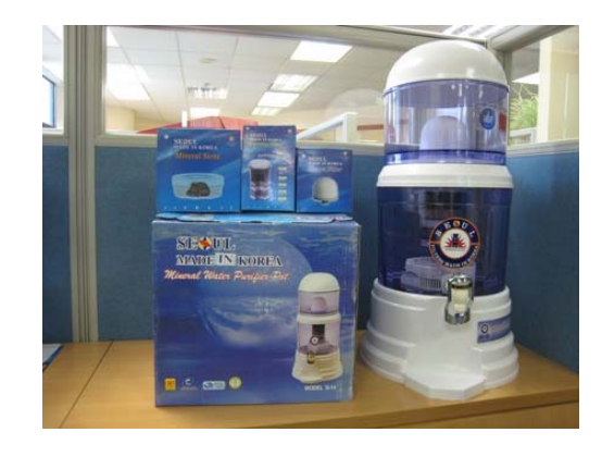
Mineral Water Purifier