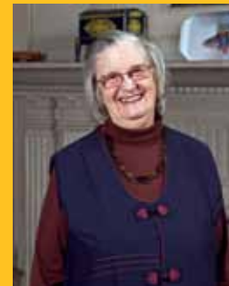
Elinor Ostrom , Distinguished Professor at SPEA, co-recipient of the 2009 Nobel Prize in Economic Sciences.

http://www.indiana.edu/~spea/prospective_students/index.shtml